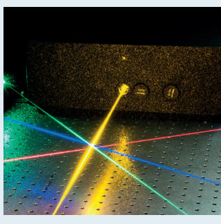
Prototype »C-WAVE« OPO: widely tunable VIS-NIR source