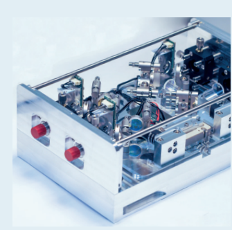
Module for MIR-to-NIR